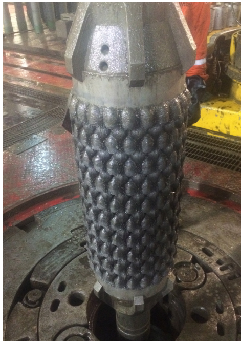
Effective junk basket and riser magnet clean up using TADS-SF displacement system.